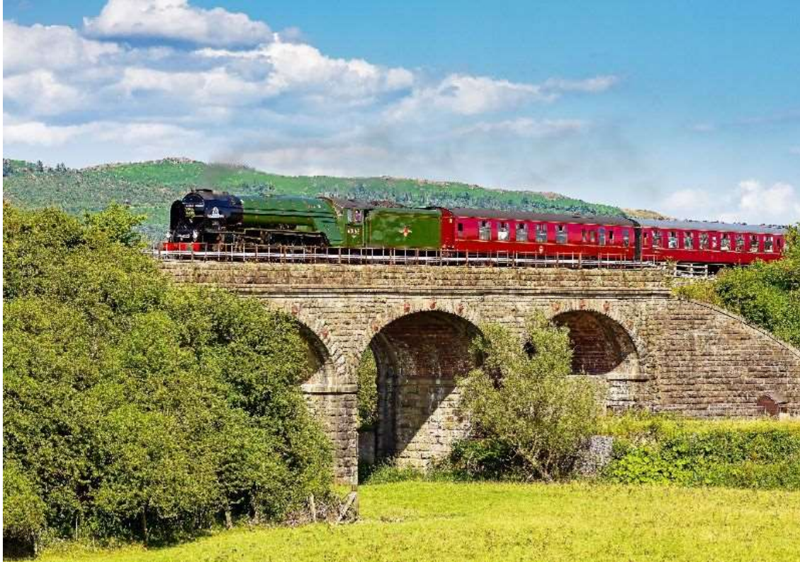
No. 60163 Tornado at Gargrave on 20 th July 2021 hauling 'The Viking Venturer'

Well, we really are back amongst it, with Tornado working hard fulfilling our 'Aberdonian' series of trains in Scotland and supporting West Coast Railway's 'Northern Belle' trains too!