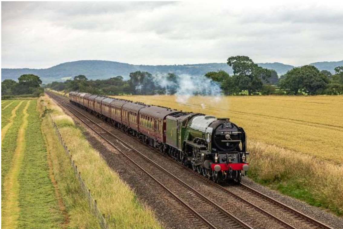
No. 60163 Tornado at Beeston on 15 th July 2021 hauling 'The Cheshireman' for The Railway Touring Company

60163 TORNADO New Steam for the Main Line