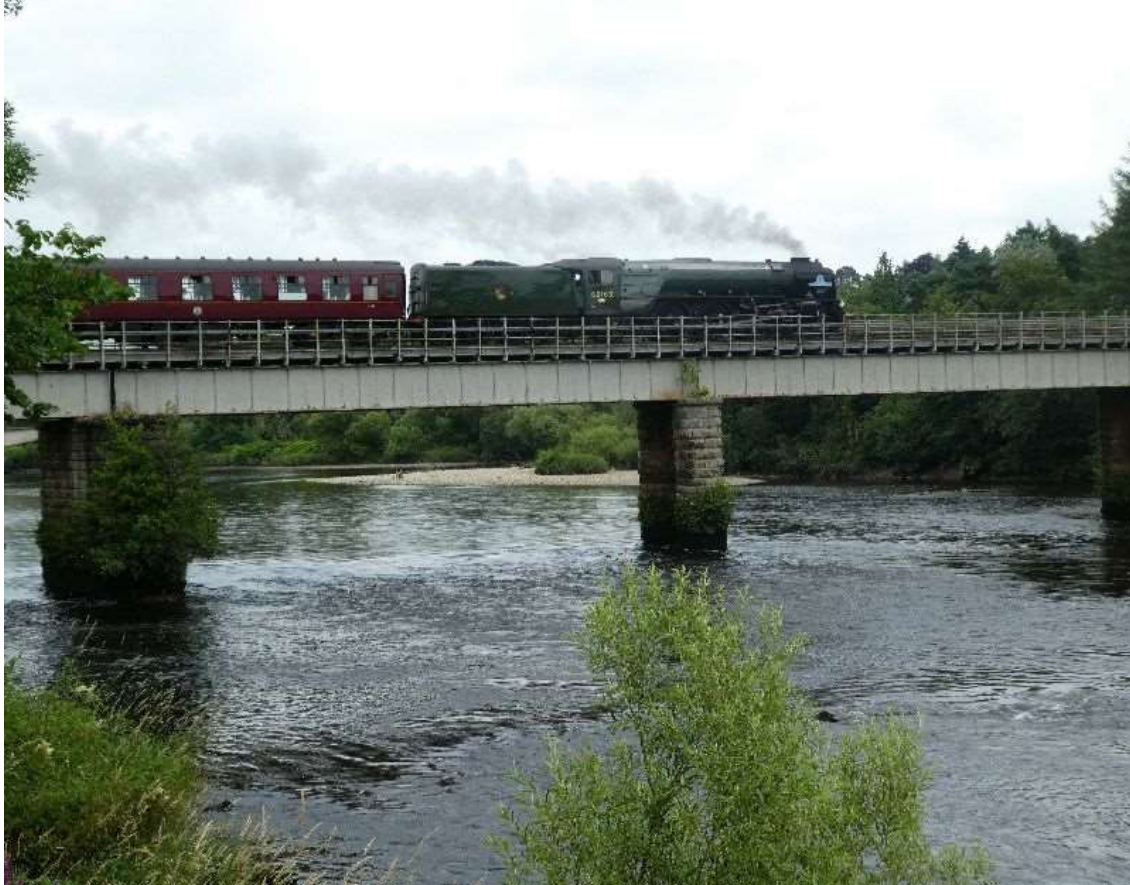
No. 60163 Tornado on 22 nd July 2021 crossing the Tay Bridge, Perth hauling 'The Aberdonian'

There is nothing better than main line steam, especially with Tornado at the head of the train, so please have a look at the diary below and we look forward to welcoming you on-board.