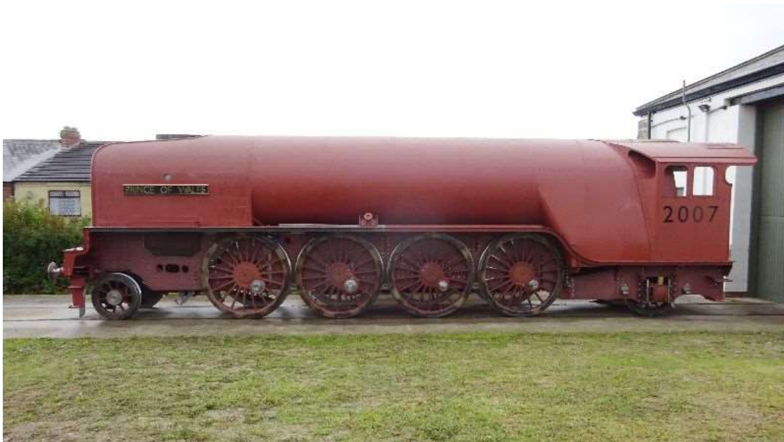
No. 2007 Prince of Wales at Darlington Locomotive Works

As a small charity we value your continued support and are reviewing all our activities on a frequent basis to protect everyone involved with the Trust and to secure our long-term future. Please keep an eye on our website and Facebook pages for updates or call 01325 460163 or email enquiries@a1steam.com if you have any questions.